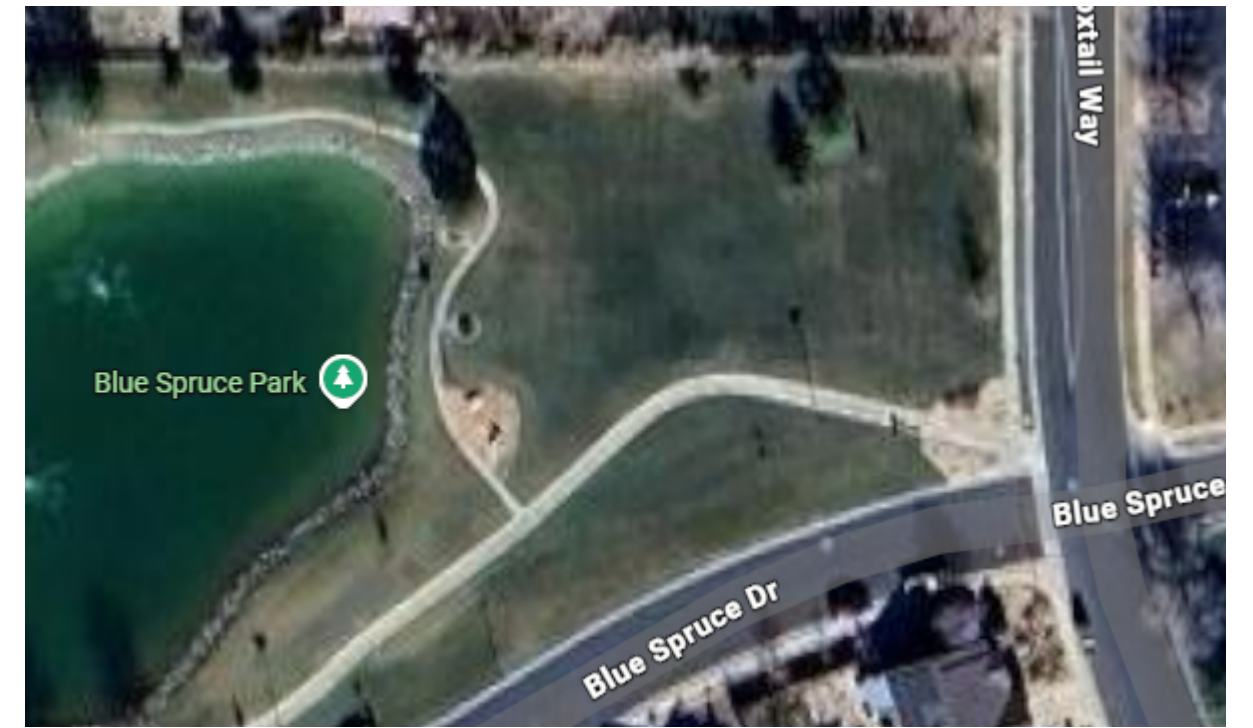
Blue Spruce Park